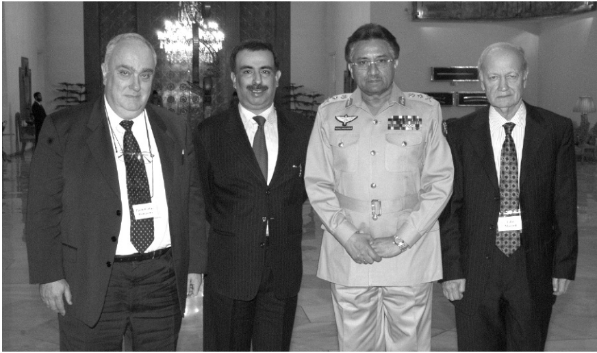
..... Paolo Cotta-Ramusino, Amitabh Mattoo, Pres. Pervez Musharraf, and Gen. Talat Masood at the Pugwash Conference on Kashmir, Islamabad, March 2006. .....

tances. 21 The latter forms a major part of resources flowing into the state for private use. The state's economy has been adversely affected in recent years due to a significant decline in agricultural productivity. 22 Industrial development in the state has been sluggish. Despite an increase in the number of industrial estates over the years, only marginal progress has been achieved in terms of industrial production. The unemployment rate is estimated between 35-50 percent. 23 The Northern areas register a per capita income of approximately USD 120. 24 The economy is agrarian, but productivity is low due to the harsh climatic conditions. Industrial activity is minimal. There is hardly any developed urban town to speak of in the entire northern belt.