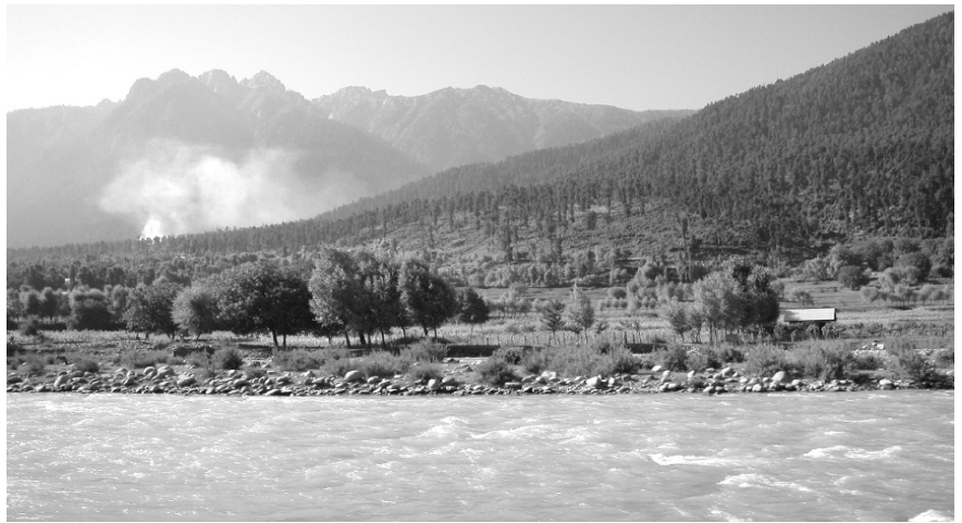
En route to Sonamarg in Kashmir

For any program of economic uplift and increased trade activity in Kashmir, an adequate transport infrastructure is essential. Without this, much of the efficiency gains possible from