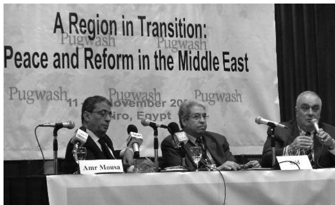
The 2006 Pugwash Conference in Cairo

such as election of the Council and confirmation of the President and Secretary General, as well as the revision of the documents on the goals and principles of Pugwash.