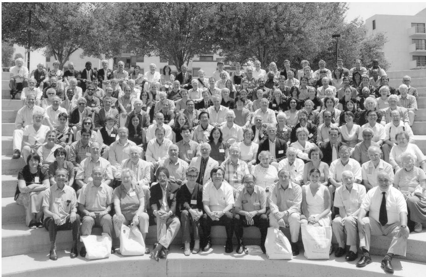
Participants at 2002 Pugwash Conference, La Jolla, California

Its main objective is the elimination of all weapons of mass destruction (nuclear, chemical and biological) and of war as a social institution to settle international disputes. More generally, its goals encompass all issues that lie at the interface between science and world affairs, on which the committed and competent intervention of scientists can play a useful role (see the parallel document “Goals of Pugwash”).