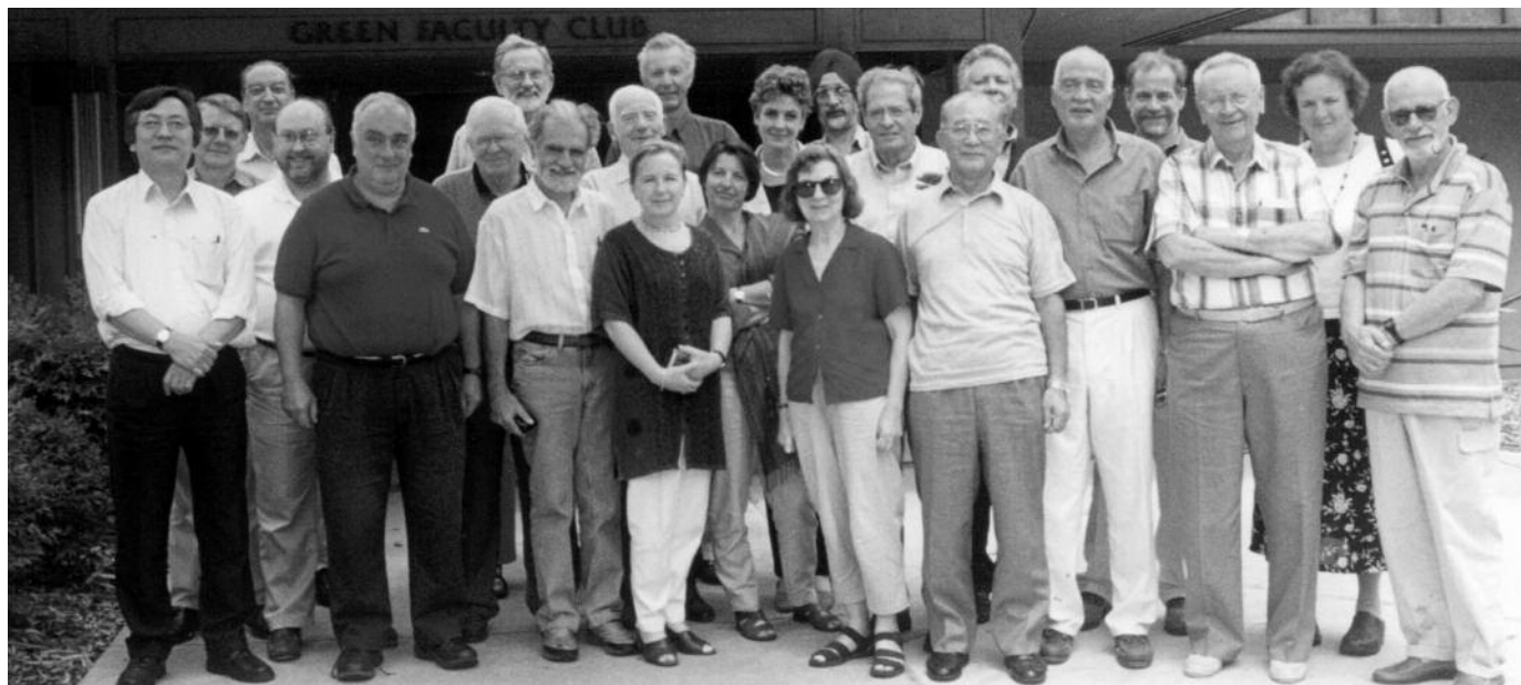
Pugwash Council 2002

[Adopted by the Pugwash Council, 14 August 2002, La Jolla, CA]