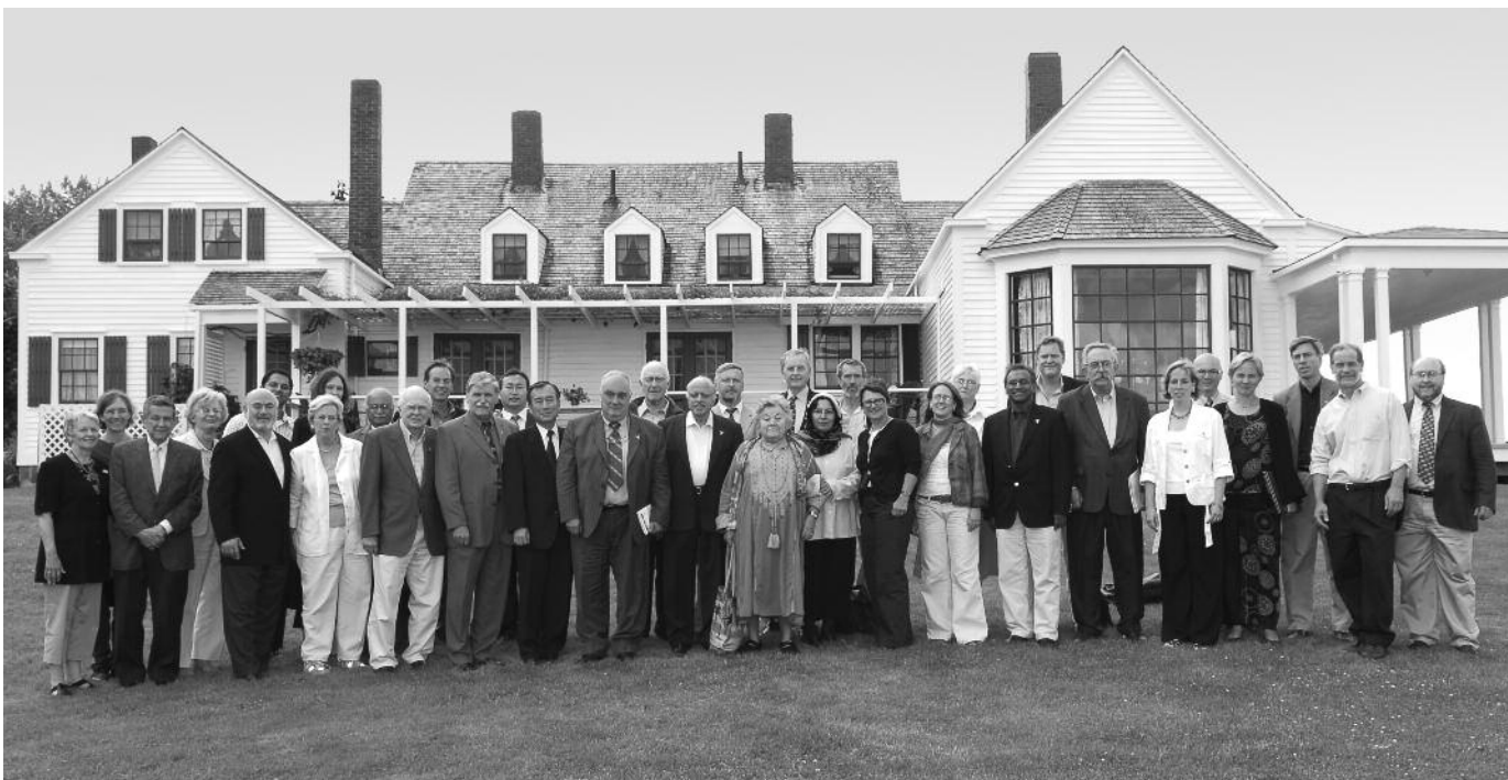
Participants and Guests of the Pugwash 50th Anniversary Workshop, Revitalizing Nuclear Disarmament, co-sponsored with the Middle Powers Initiative, July 2007, Pugwash, Nova Scotia