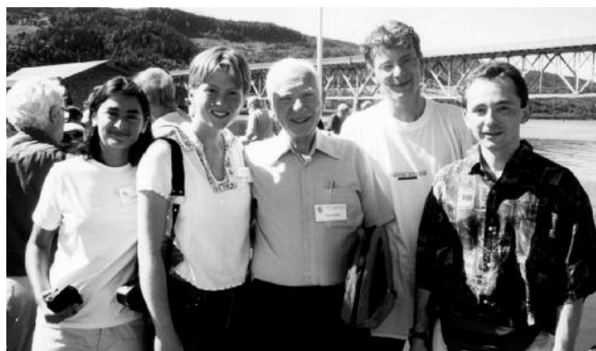
Jo Rotblat and members of Student Pugwash

In 1997 a Student/Young Pugwash “pre-conference” was held in Lillehammer, Norway, prior to the annual Pugwash conference, which initiated a tradition that has continued every year through to the present. The ISYP Journal on Science and World Affairs aims to serve as a