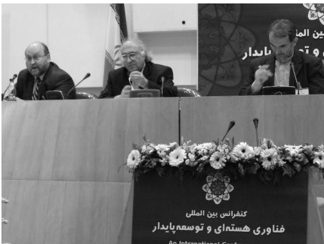
A Pugwash Workshop in Iran, April 2005

The Secretary General is the executive officer of Pugwash and has responsibility for the organizing of activities, the international offices, financial transactions, and official correspondence of the Pugwash Conferences. The Secretary General has the responsibility for formulating decisions related to the proposed agenda, nominations of chairpersons, speakers, and authors, and lists of participants for Pugwash conferences and workshops. The Secretary General will keep Council informed on a timely basis of his/her decisions and actions, and in all aspects the Secretary General is ultimately accountable to the Council.