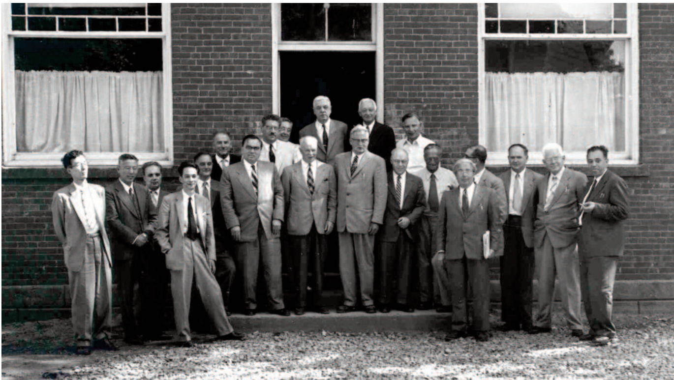
The First Pugwash Conference, July 1957