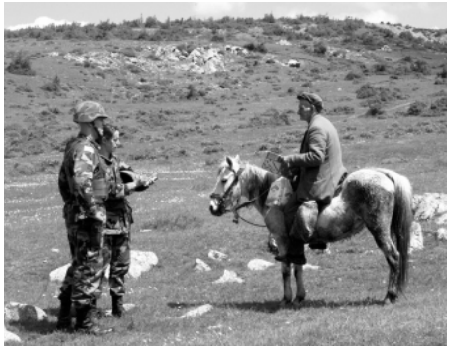
KFOR patrol with Kosovar Serb.

Regarding procedural rules underlying the use of force, should one rely solely on Security Council authorization? Can there be cases of implied authorization, based on existing UNSC resolutions (recognizing that these could be politically manipulated; e.g., the use of an Arab force in defense of the Palestinians)? What about General Assembly authorization (again, acknowledging that this could be politically misused)? Finally, what new legal norms might