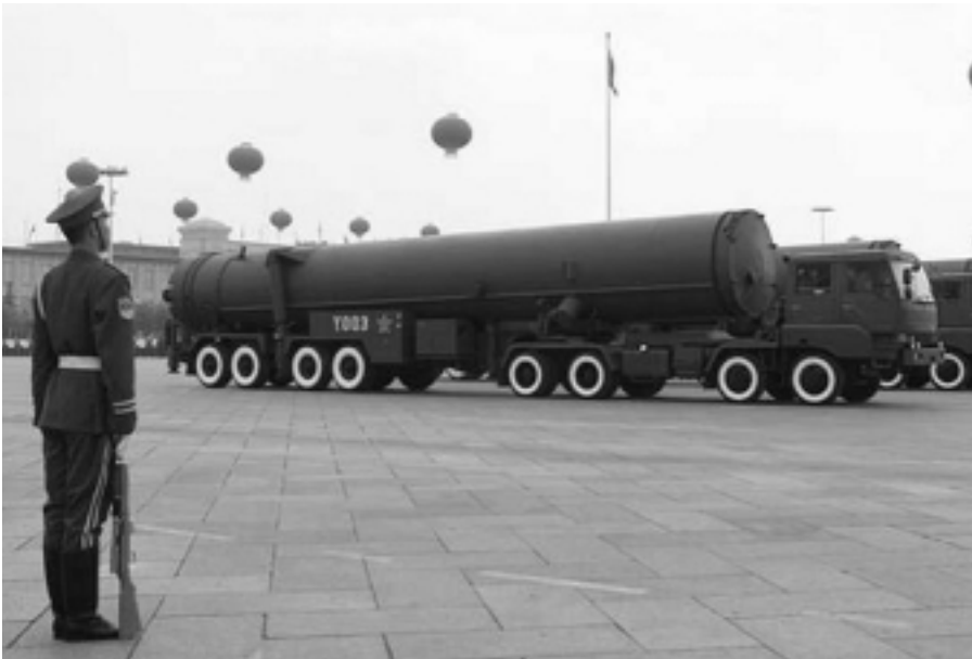
Chinese ICBM DF-31.

to non-nuclear-weapons states in the form of civilian nuclear assistance.