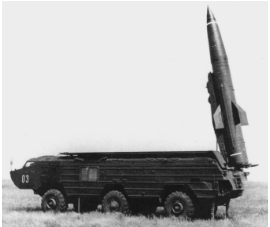
Russian SS-23 Spider

Others objected strongly to these assessments, arguing that missile defense would raise the perceived likelihood that the US would “intervene with impunity,” and that this would place hostile states under great pressure to develop and deploy nuclear weapons. Thus, missile defense could be an inducement to weapons proliferation. Another argued that the “stability” argument for missile defense is specious, asking rhetorically, “Is there any precedent for one side arming itself with shields, and the other side giving up swords?” The implied answer was “No.”