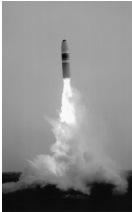
Launch of Trident missile.

The workshop took place just days before the terrorist attacks on New York and Washington, DC., which dramatically changed the global political environment. While summarizing the discussion as it took place, this report does take into account the post-September 11 situation, particularly in terms of workshop discussion of non-state threats.