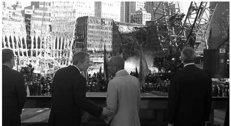
President George W. Bush and UN Secretary General Kofi Annan view the aftermath of the September 11 bombing of the World Trade Center in New York

In order to safeguard global peace and security, it is essential that national governments and the world community recognize that the twin dangers of international terrorism and nuclear proliferation pose entirely new threats that demand immediate and sustained attention.