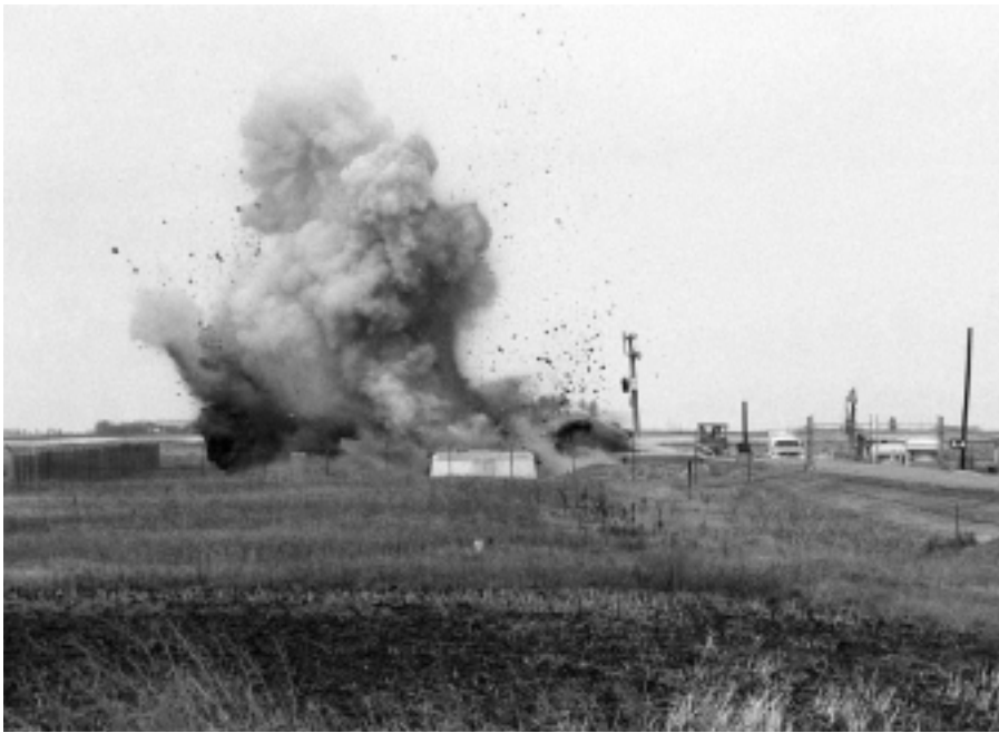
Destruction of a Minuteman III silo

and the West have, in important respects, taken a turn for the worse in the last several years, because the nuclear weapons states have made it clear that they continue to see nuclear weapons as critical components of their military postures and policies, with, in the case of Russia, there being evidence of even increasing emphasis on them, and because of continuing, and perhaps even increasing, risks of the spread of nuclear weapons and fissionable materials.