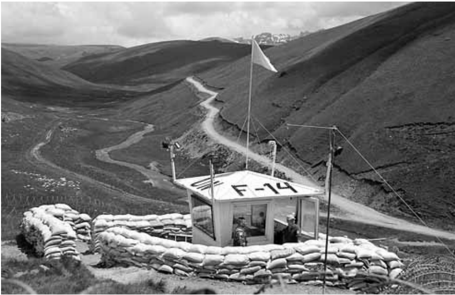
UN outpost in Macedonia